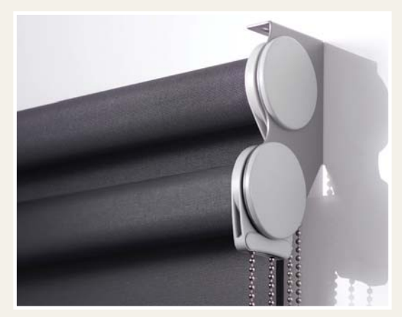
Standard Dual Roller